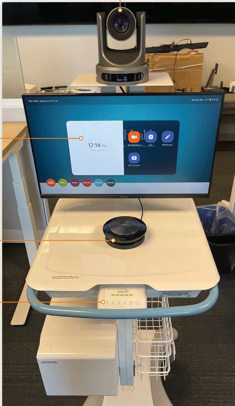
DRAWER KEYLOCK/ BATTERY INDICATOR